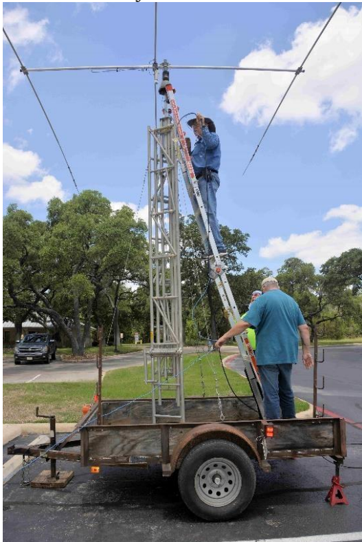
Setting up the club's beam antenna

Setup is Saturday AM and teardown when we stop on Sunday. Barbeque comes Saturday afternoon.