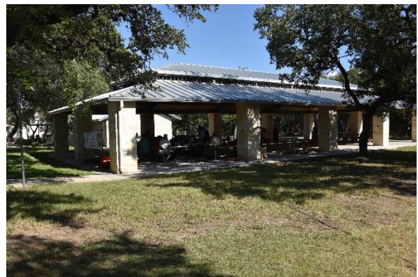
The pavilion at Shavano Park Government Center

participate too. It is certain that a female voice on Field Day draws a crowd on the air.